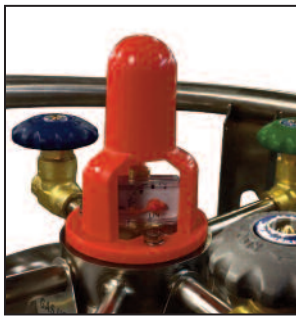
The Laser-Cyl 200L Liquid Cylinder comes equipped with the Roto-Tel™ Liquid Level Gauge design.