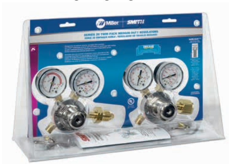
HTP2 – CGA 510 inlet connection for acetylene and LP cylinders HTP5 – CGA 300 acetylene inlet connection