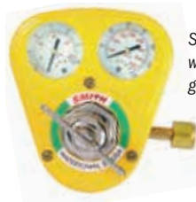
Series 40 regulator shown with HB190 Hard Hat™ gauge/regulator guard.