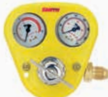
Series 30 regulator shown with H195 Hard Hat™ gauge/regulator guard.