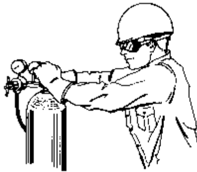
Fig. 2 The correct way to safety check a system.

Because oxidizers change the chemistry of fire, a material that does not burn in air may ignite or react violently in an oxidizer atmosphere. Equipment used in oxidizer service should be selected with materials of construction that minimize the probability of ignition and the risk of fire or explosion. This equipment must be cleaned to remove any contaminants such as oils or grease. Care